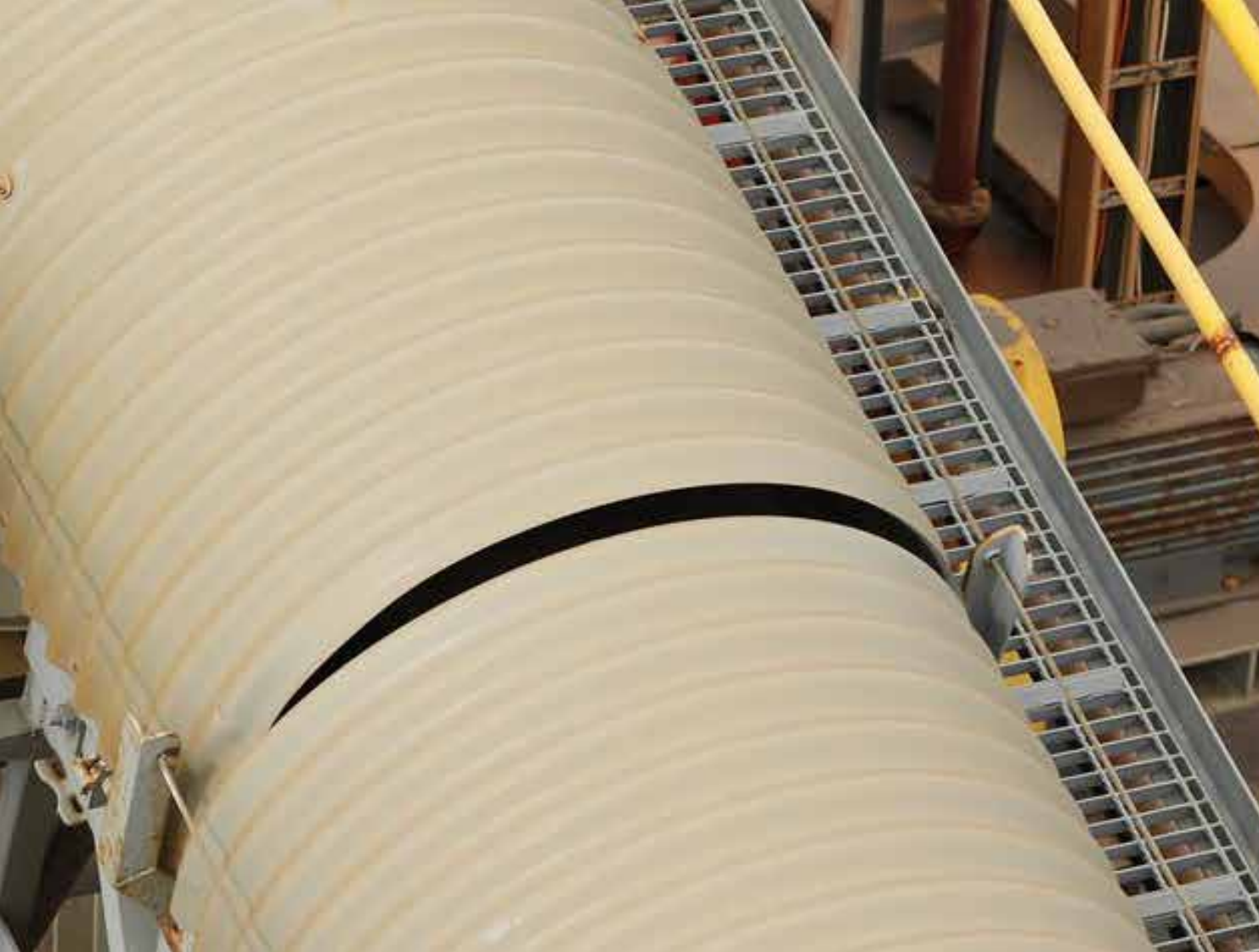
Narngulu Mineral Separation Plant