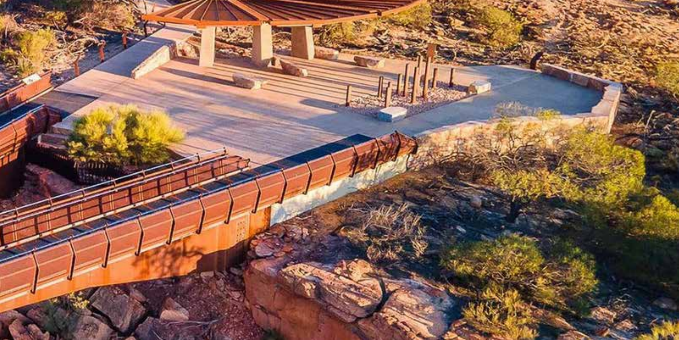
Image: Geraldton Building Services and Cabinets (GBSC) - Kalbarri Skywalk