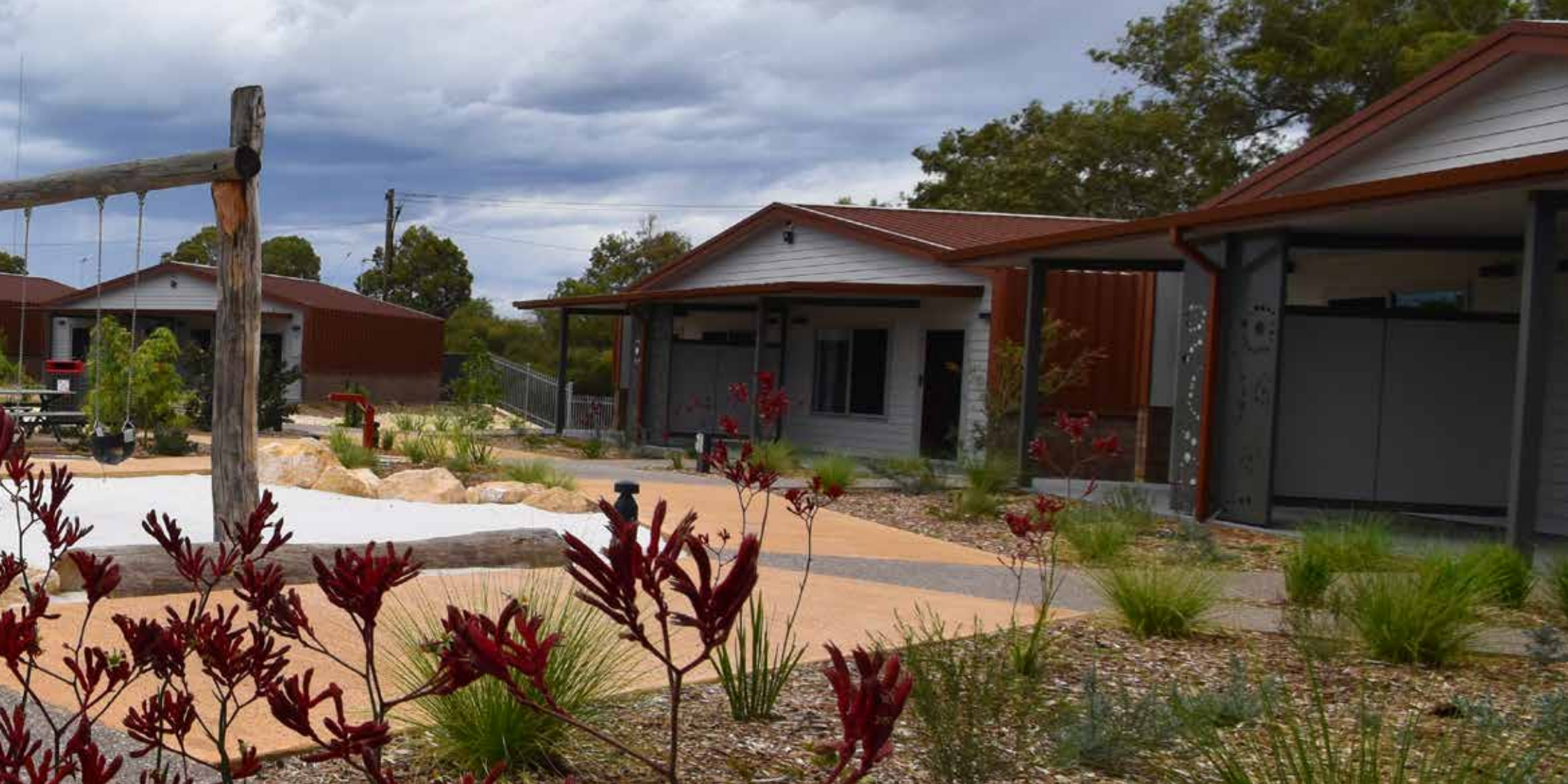
Image: Geraldton Building Services and Cabinets (GBSC) - Bundiyarra Regional Aboriginal Community Kinship Stay (BRACKS)