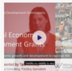
Video 8 - Key project question: Viability