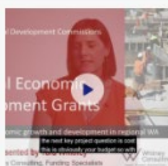
Video 9 - Key project question: Cost