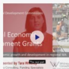
Video 11 - Budget and market viability