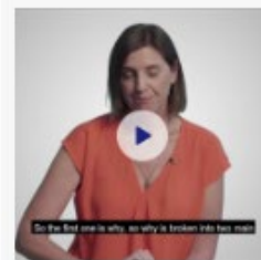
Video 4 - Key project question: Why?