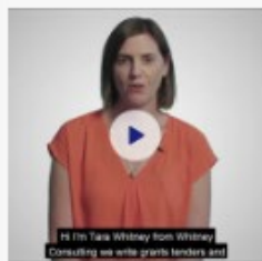
Video 1 - Introduction and about RED Grants

https://www.peel.wa.gov.au/regional-economic-development-red-grants-scheme/red-grant-writing-video/