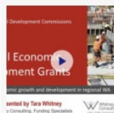
Video 12 - Application summary