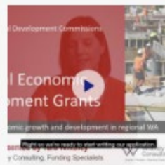
Video 3 - Grant writing overview