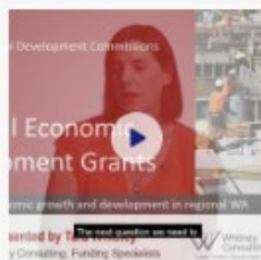
Video 6 - Key project question: How?