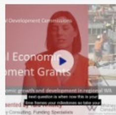
Video 7 - Key project question: When?